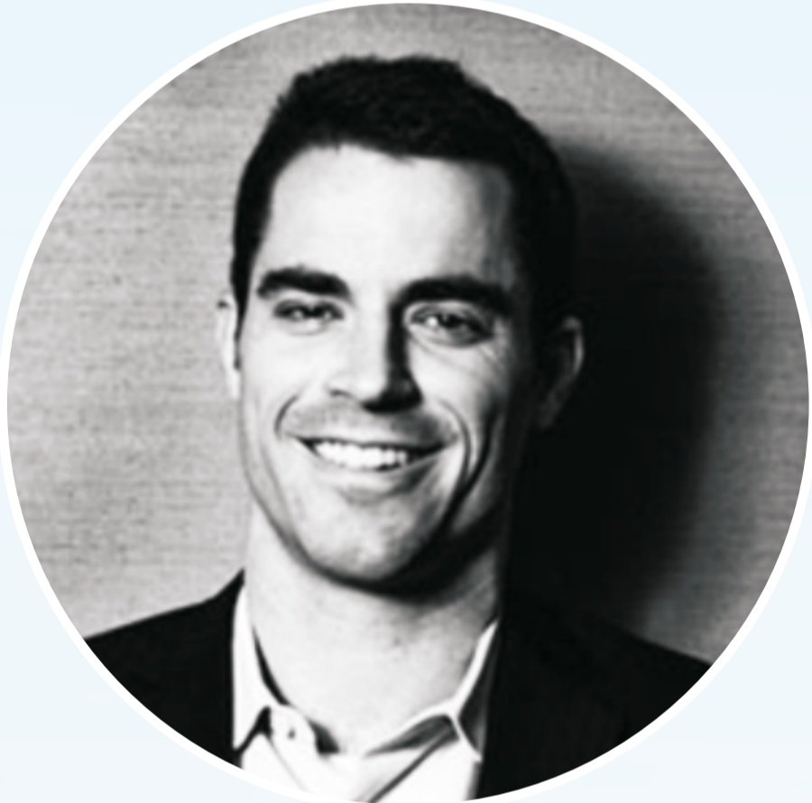
ROGER VER CEO - Bitcoin.com