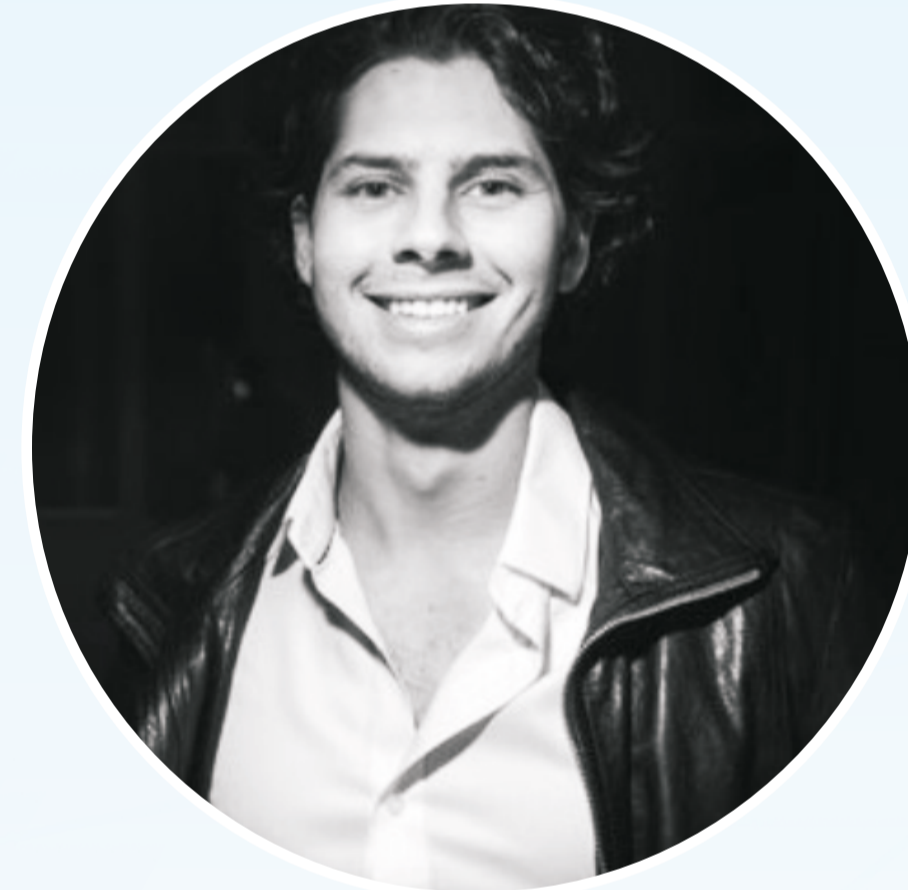
MATE TOKAY COO - Bitcoin.com